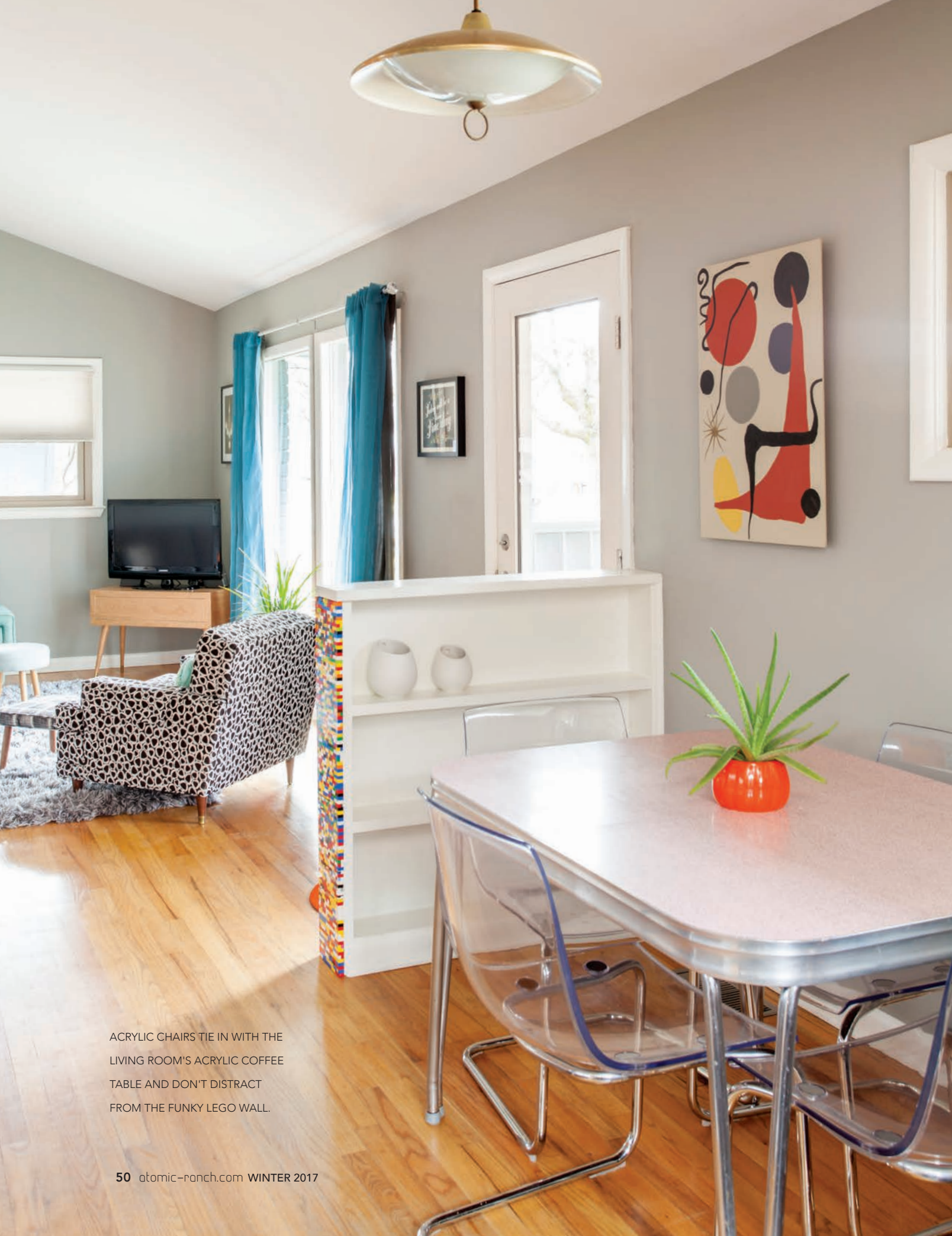
ACRYLIC CHAIRS TIE IN WITH THE LIVING ROOM'S ACRYLIC COFFEE TABLE AND DON'T DISTRACT FROM THE FUNKY LEGO WALL.